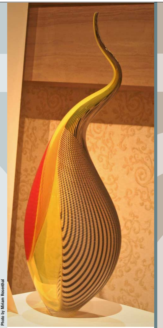
Lino Tagliapeitra's "Dinosaur" is the kind of piece which will be in the Renwick Gallery exhibition called Lino Tagliapietra in Retrospect: A Modern Renaissance in Glass